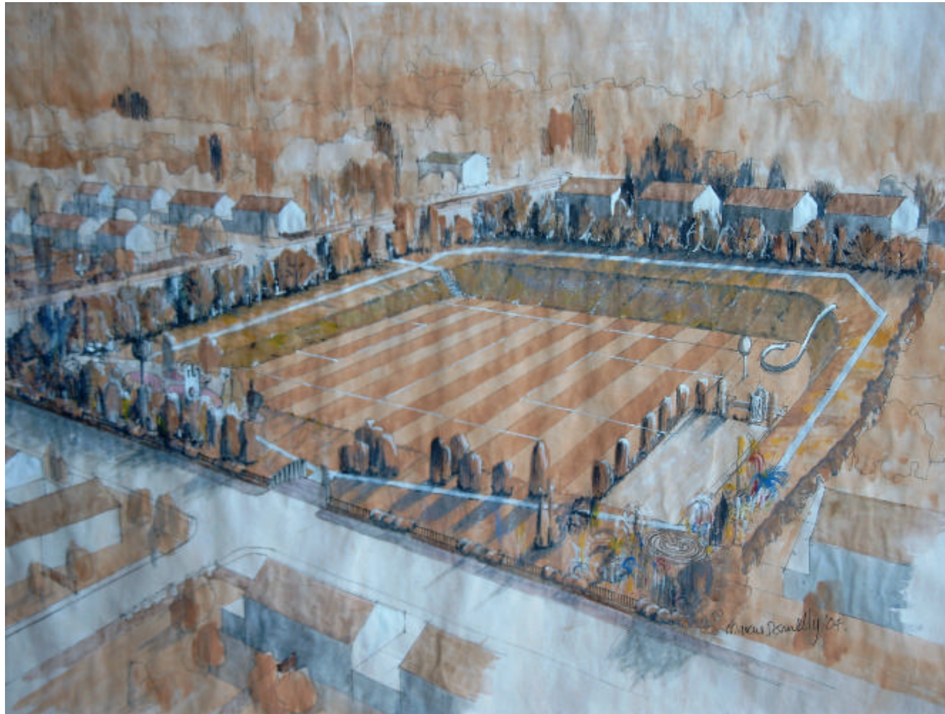
Ballinlea Park – Perspective drawing by Marcus Donnelly 2004